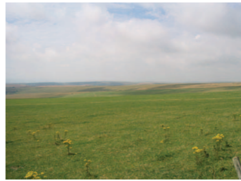
Eastern Downs dip slope from Devil's Dyke