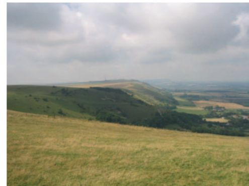
Scarp slope from Devil's Dyke