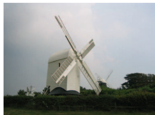
Jack and Jill Windmills