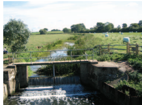
River Adur, Wineham