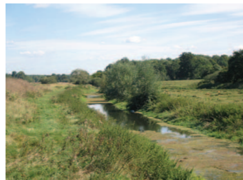
Adur Valley, Henfield