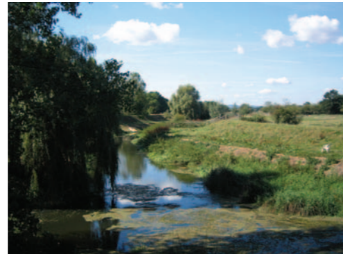
River Adur, Shermanbury