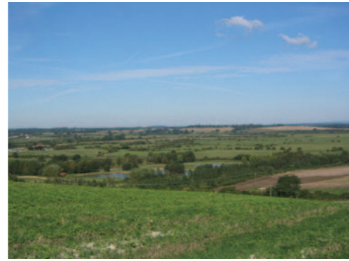
Adur Valley, Upper Beeding