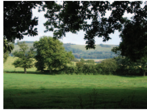
Scarp footslope, Poynings