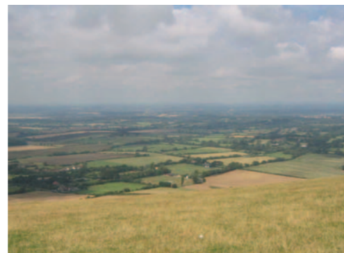
Fulking from Devil's Dyke