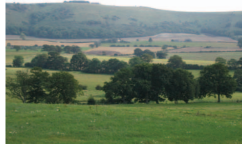
Scarp footslope, Fulking