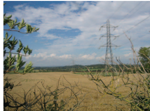
North from Perching Sands