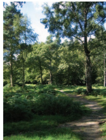
Cowdray Forest, Balcombe