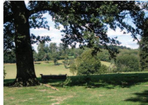
St Leonards Forest