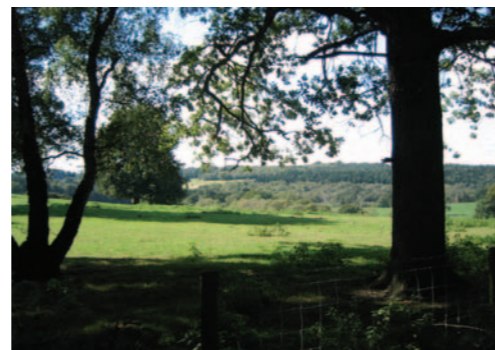
St Leonards Forest