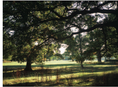
Wood pasture, Cowfold