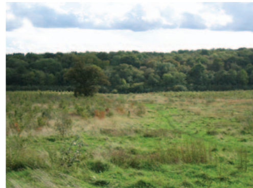
Millenium Wood, Borde Hill