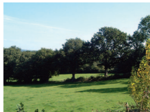
Hedgerow trees, Wealden Fringe