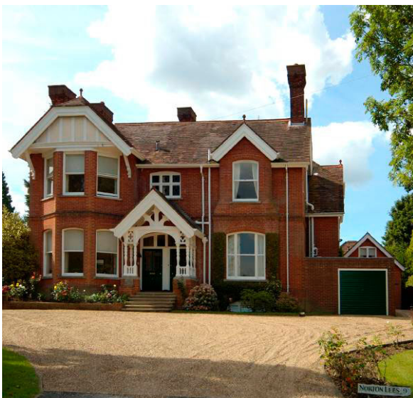
Fig. 16. Late 19 th -century detached villa: Norton Lees, 9 Oathall Road.

A more distinctive feature of the early building and topography of Haywards Heath, however, is the villa. By 1874, clusters were evident on the south side of Muster Green, St Wilfrid's (now, Church) Road, Sydney Road, and South Road. The semi-detached house dominated these clusters, but larger detached houses with more extensive grounds were built as one-off developments: notable examples at Elfinward (Butlers Green Road), Oaklands and Limehurst (Paddockhall Road), Clair House (Perrymount Road), and Fairlawn (Oathall Road) were all in existence by 1874, but have now gone. Construction of such large detached villas continued after 1874, however, and numerous examples survive from the period before 1900 along Church Road, Oathall Road, and Paddockhall Road.