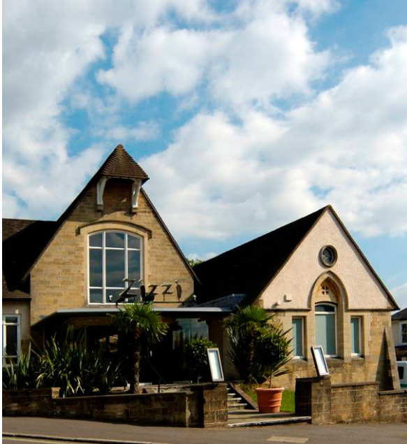
Fig. 9. The former Anglican school-chapel.

Informal services conducted by Cuckfield clergy were replaced by a dedicated priest, from 1856 within a dedicated building, the school-chapel, later St Wilfrid's school. Construction of St Wilfrid's church began in 1863 and was consecrated in 1865: at this point Haywards Heath became its own ecclesiastical parish. 34 An increase in the number of parishioners was reflected in the extension of the churchyard in 1899. 35 Indeed, such were numbers that the new parish church soon needed daughter chapels.