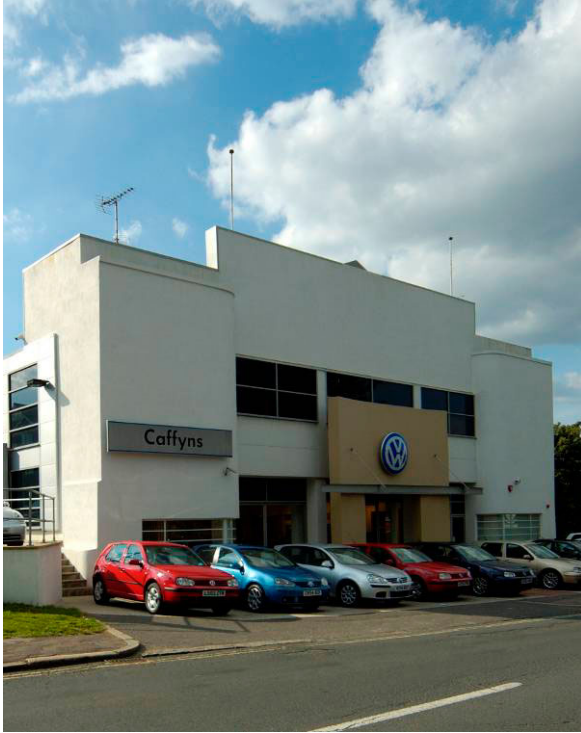
Fig. 20. Caffyns garage, Market Place.