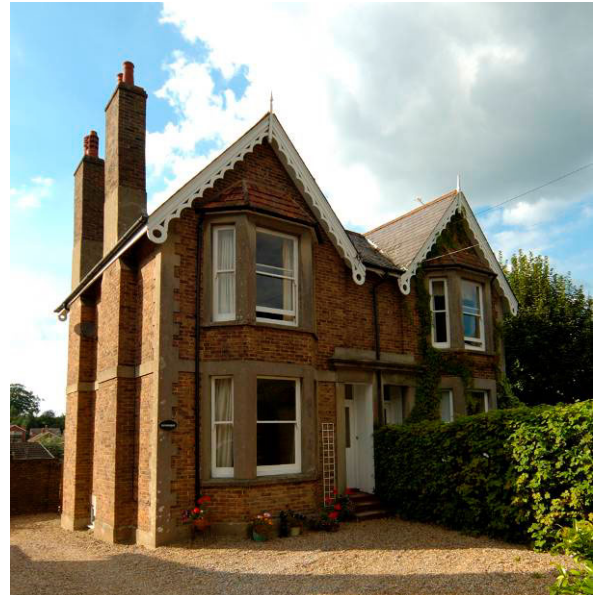
Fig. 17. Late 19 th -century semi-detached villas: 42 and 44 Paddockhall Road.

more often representing modest housing. For example, semi-detached houses were a feature of the building along the west side of Sussex Road/Wivelsfield Road, on adjacent and new Gower Road, and on Mill Green Road.