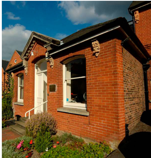
Fig. 18. Early 20 th -century offices: Paddockhall Chambers, Paddockhall Road: 1917 (previously – 1908-17 – a parish room).

housing. Such offices provide some commercial linkage between the smaller retail centres of Commercial Square, The Broadway, and Market Place/Boltro Road, but the shopping centre of the town remains as it was in 1900 – resolutely polyfocal.