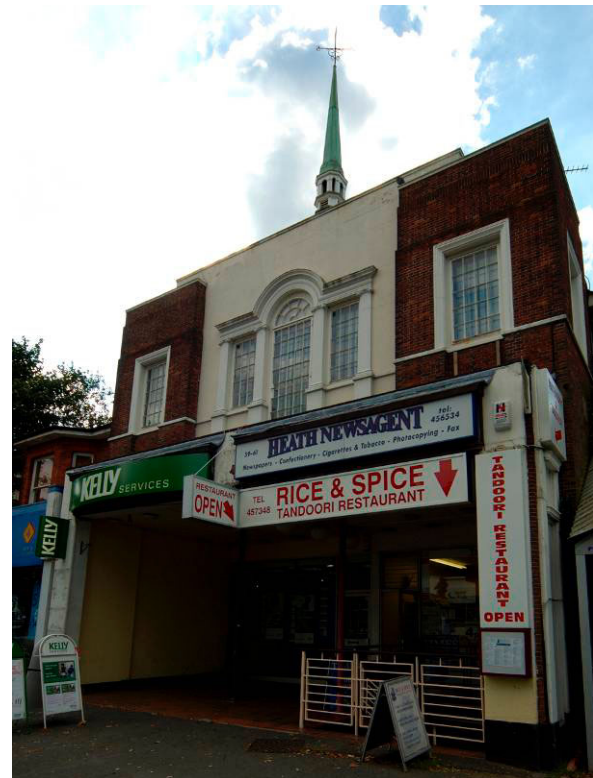
Fig. 13. The former Heath Theatre cinema, The Broadway.

The first cinema in Haywards Heath – the Heath Theatre, The Broadway – opened c.1911, and was typical of early cinemas in that it was small scale. This was replaced by the larger Broadway Cinema in Perrymount Road in 1932 (finally closed 1986, demolished 1987) and the Perrymount Cinema near Commercial Square in 1936 (closed 1972, demolished 1984). 60