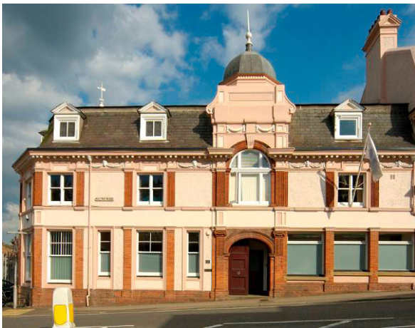
Fig. 7. Former Capital and Counties Bank (later Lloyds), Boltro Road (1889).

The expansion of the nascent settlement from the early 1860s was rapid, though not easily quantifiable in terms of population since, notwithstanding the creation of a Local Board in 1872, Haywards Heath remained part of Cuckfield parish. In 1894 a new civil parish was created, however, and governance was then provided by Haywards Heath Urban District Council. 30