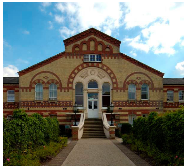
Fig. 6. The former Sussex County Lunatic Asylum.

An important stimulus to subsequent growth of the town was the building of a mental hospital for the county on a site 1.7km south of the station, at Hurst House Farm. Such an establishment was planned in 1846, when national criteria for the siting of mental hospitals included centrality, openness, elevation, and proximity to the railway. Although not chosen until 1854, Haywards Heath evidently offered all of these, and the Sussex County Lunatic Asylum opened in July 1859. The hospital was vast, with 425 places, and without doubt was a significant boost to the local economy, through construction, employment, and demand for housing. 28