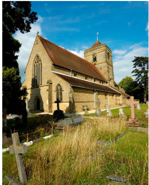
Fig. 15. St Wilfrid's church from the south-west.

Most obviously from this period is St Wilfrid's church of 1863-5 (Grade II). The church's subsidiary position to Cuckfield is reflected in the choice of architect: G. F. Bodley had been responsible for the major restoration of the parish church in 1855-6. With no obvious centre to the emergent settlement, the location of the new building echoed ancient Wealden churches located on ridge-top routeways and next to markets: St Wilfrid's is located on the high point of the town near the busy junction (and commercial focus) of The Broadway, South Road, Muster Green, and Church Road. Other surviving early ecclesiastical buildings comprise the former Congregational chapel in Wivelsfield Road (now St Edmunds Scout Hall: 1861); the Jireh Strict Baptist church in Sussex Road (1879); the chapel of the Priory of Our Lady of Good Counsel (Grade II; 1890-7); and the Wesleyan Methodist church in Perrymount Road in 1900 (see above, section 3.2.2).