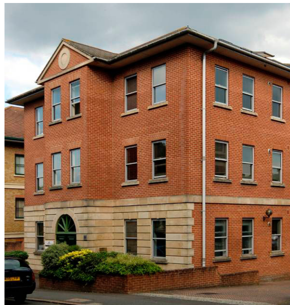
Fig. 12. Late 20 th -century offices: 33 Boltro Road (1989).

development of a distinct business district in the late 20 th century, especially related to financial services, in the Perrymount Road and Boltro Road area has created substantial employment. As with Mid Sussex District in general, 45 however, the resident workforce of Haywards Heath in the late 20 th century has exceeded the number of jobs: in addition to traditional (railway-based) commuting destinations of London and Brighton, the growing dominance of the Crawley and Gatwick area has become a magnet to residents of the town.