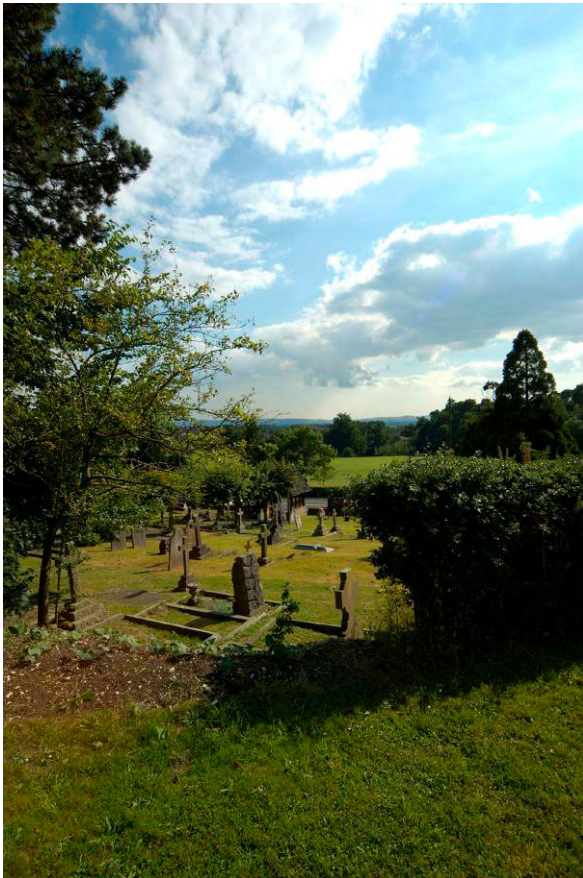
Fig. 2. View from St Wilfrid's church southwards, with the South Downs in the distance.