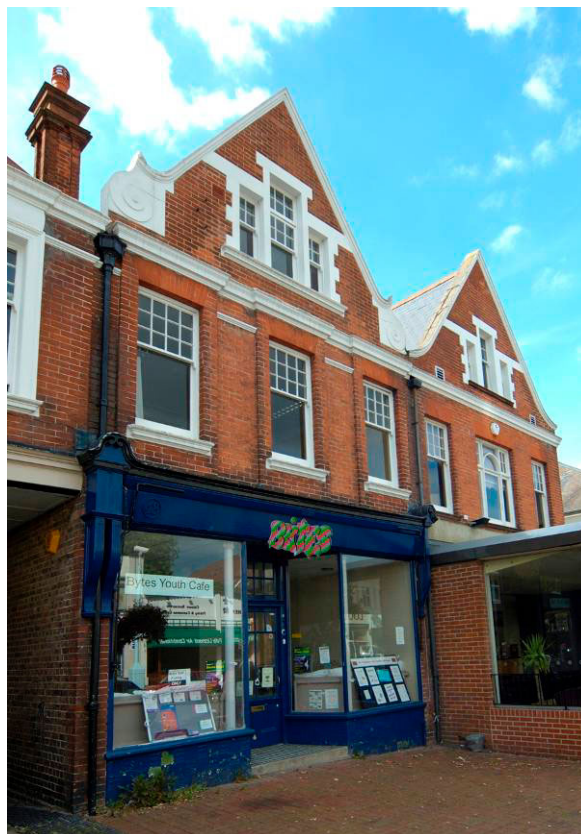
Fig. 19. Edwardian shops at 43 and 45 The Broadway.