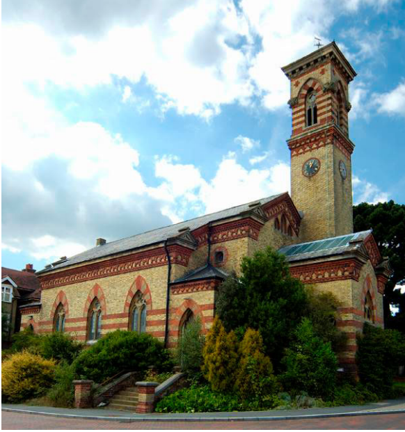
Fig. 14. Chapel of the former Sussex County Lunatic Asylum.

With the rebuilding of the original railway station (1841) in Market Place c.1880 and its replacement by that on the current site c.1933 mean that a key architectural monument to the origins of Haywards Heath has been lost. This has been compounded by the demolition of most of the early cluster of businesses – such as the Liverpool Arms – and houses around the station, so that the former Station Inn, or hotel, is the only survivor (now Zenith House, built by 1843). The fortunes of the former County Lunatic Asylum (1859; Grade II) have been better, for it survives, albeit converted to housing after closure of the hospital in 1995.