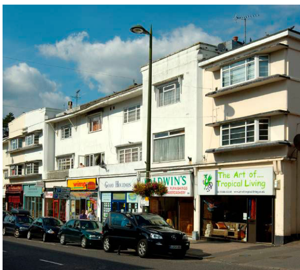
Fig. 11. Pre-war shops and flats, 118-20 South Road.

The long link between Hayward Heath and its rural hinterland was broken in 1989 when the market finally closed. Bannister Way was then built through the site to link Harlands Road to the new supermarket immediately north of the former market in 1991. 44