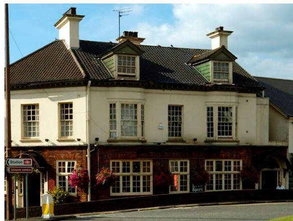
Fig. 8. The Burrell Arms, Commercial Square.

Industry tended to be directly related to the needs of building the town. The early timber yards and their successors continued, but a more substantial industry was that of brickmaking. In 1874-5 there were brickyards on the west side of Hazelgrove Road, on the south side of Franklynn Road, and on the north side of Ashenground Road (still in existence in 1899). Two other brickyards were in use by 1882 on the south side of New England Road (one closed by 1912, the other continuing until 1939). The builder Jesse Finch had opened another brickyard where Dellney Avenue now is by 1895 (which survived until the 1930s). 33