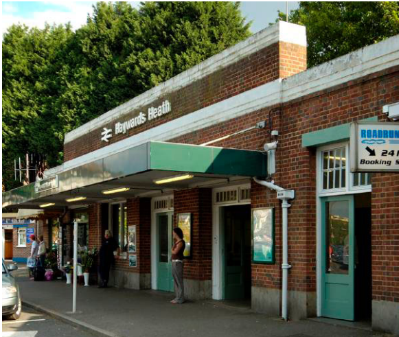
Fig. 21. The railway station (1932).

The expansion of housing has been considerable in the 20 th century. Whilst most of this building, and rebuilding, has occurred outside the EUS study area, the main developments can be usefully summarized here.