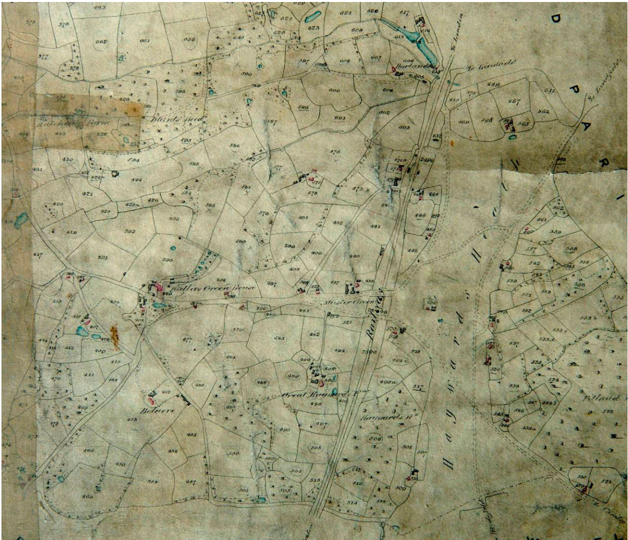
Fig. 22. Haywards Heath tithe map, 1843 (copy in West Sussex Record Office).