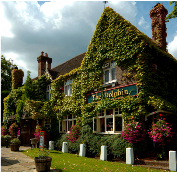
Fig. 3. The Dolphin, Butler's Green Road.

The evaluation at Beech Hurst Gardens produced evidence of possible pond and field ditch of 18 th to 19 th -century date. 13 More substantial archaeological evidence for this period, however, is provided by survivals of the scattered buildings that preceded the town, both within and adjacent to the EUS study area: