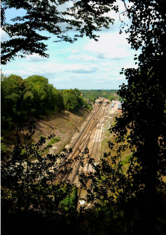
Fig. 5. Haywards Heath railway station, from the south.

The name Haywards Heath has long described the heath on which the core of the town was built. The name Hayward developed from earlier Hayworth (known from the 13 th century), evidently recording origins as a Wealden enclosure. At the arrival of the railway – which precipitated the emergence of the town – Haywards Heath was the principal topographic feature in the area, and immediately east of the station. 25