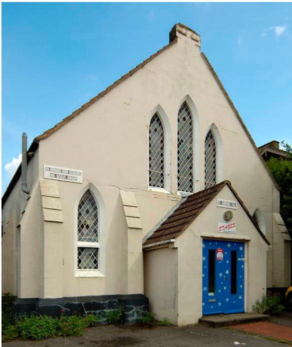
Fig. 10. Former Congregationalist chapel, Wivelsfield Road.

Informal services conducted by Cuckfield clergy were replaced by a dedicated priest, from 1856 within a dedicated building, the school-chapel, later St Wilfrid's school. Construction of St Wilfrid's church began in 1863 and was consecrated in 1865: at this point Haywards Heath became its own ecclesiastical parish. 34 An increase in the number of parishioners was reflected in the extension of the churchyard in 1899. 35 Indeed, such were numbers that the new parish church soon needed daughter chapels.