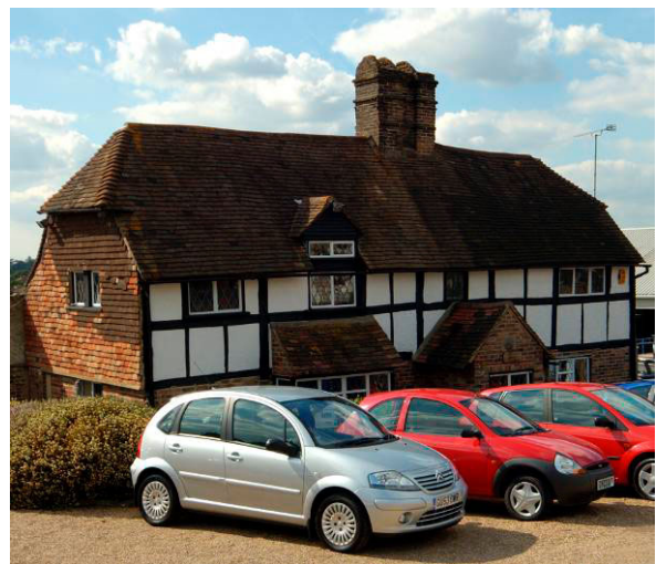
Fig. 4. 24 Wivelsfield Road.

Although the relatively modern origins of the town of Haywards Heath have resulted in less archaeological interest and excavation than in the more historic towns of Sussex, evidence for Romano-British and, especially, prehistoric occupation or use of the EUS study area has been found and should be anticipated in any future archaeological excavations. Moreover, the surviving pre-town houses confirm the normal medieval and post-medieval pattern of Wealden settlement of a high density of dispersed farmsteads. Since such settlement of the Weald has origins in Downland-Wealden Anglo-Saxon transhumance, medieval features and finds should be anticipated adjacent to these surviving historic buildings, on the site of lost or replaced pre-urban buildings, and scattered elsewhere.