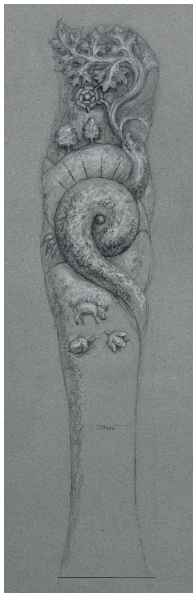
Waymarker 8 West Hoathly

If you are in need of refreshments, there are two pubs in West Hoathly – The Cat Inn, North Lane RH19 4PP and The Fox, Highbrook Lane RH19 4PJ