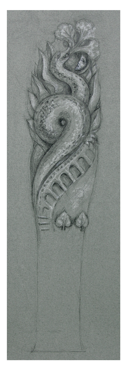
Waymarker 4 Balcombe

17. Walk on until you reach Newlands, the road curves round to the right and when you see a red postbox ahead you need to turn left, cross the road and follow the path toward Balcombe Station. Cross over London Road at the island and go in the pedestrian entrance (WAYMARKER 4), over a bridge and down the steps to the platform to return to the car park.